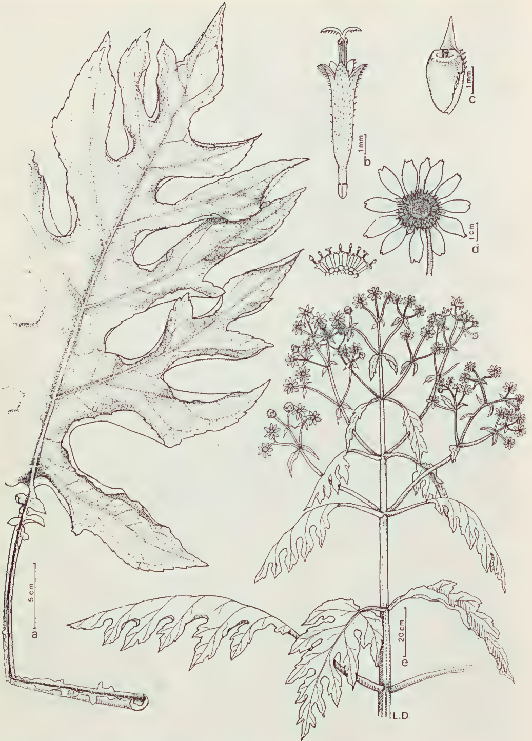
Fig. 3. Montanoa bipinnatifida (Kunth) C. Koch; a. leaf; b. disk floret; c. immature achene; d. capitulum; e. sketch of inflorescence and upper stem leaves. Illustration by L. Dutkiewicz.